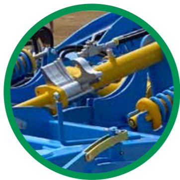
HYDRAULIC DEPTH ADJUSTMENT WITH WEDGES