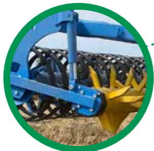
INDEPENDENT MIXTEUR ROLLER ADJUSTMENT